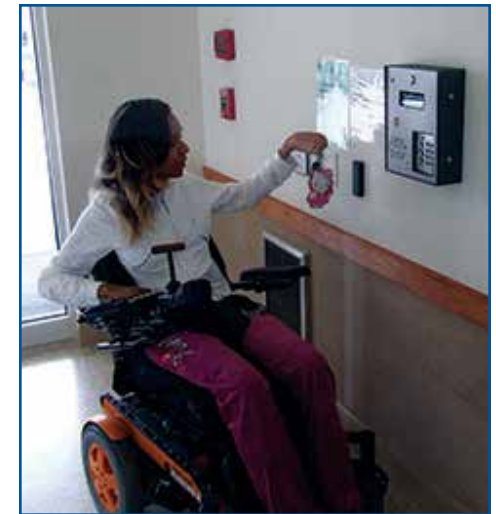
F, G Key cards and fobs enable tenants to easily open the entry doors