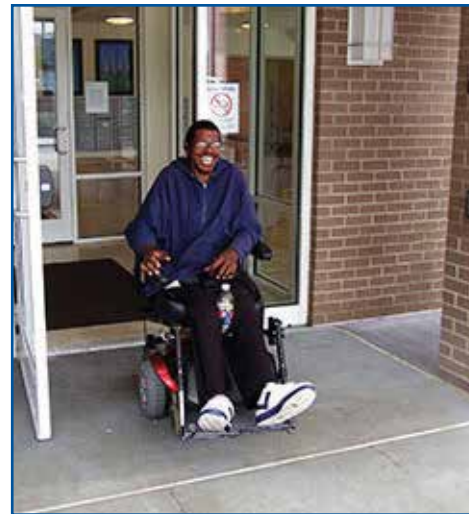
E Automatic door openers allow tenants to enter and exit at their own pace