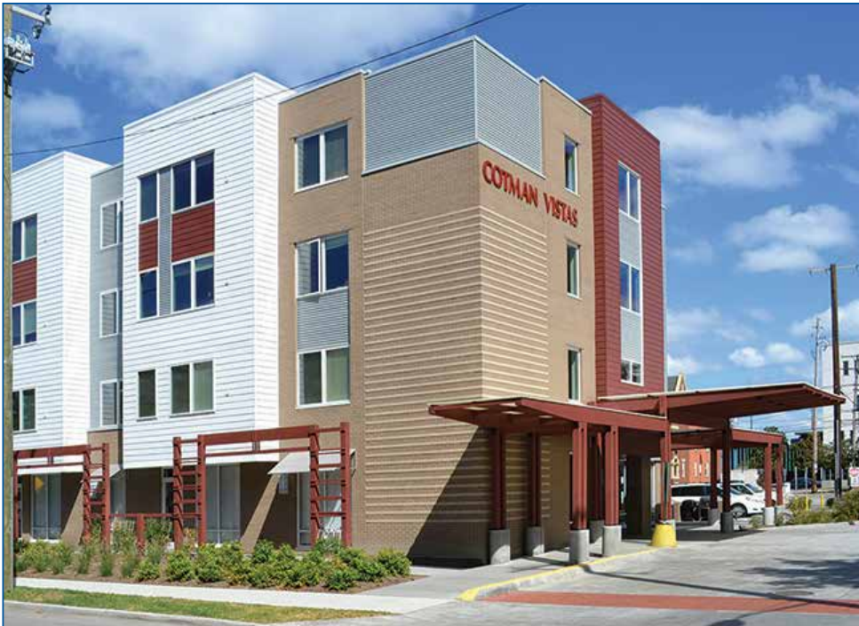
A Wide sidewalks at the entry allow tenants who use wheelchairs to easily leave the sidewalk C Porte-cochere protects tenants from the weather when entering and exiting vehicles