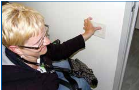
G Easy-to-reach paddle light switches