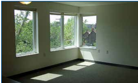
I Low, easy-to-open windows