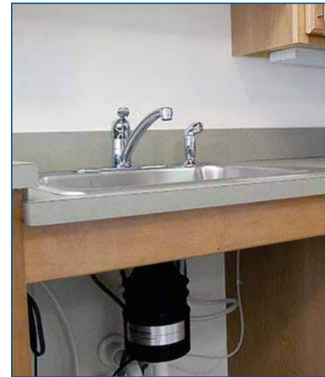
D Sink has lever handle, is open underneath E Garbage disposal and plumbing in back