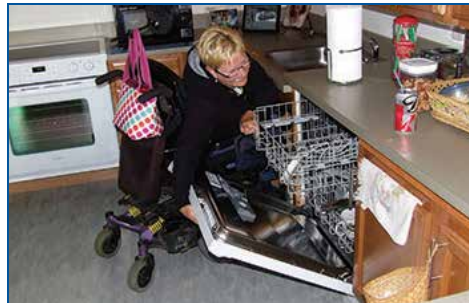
C ADA-compliant dishwasher