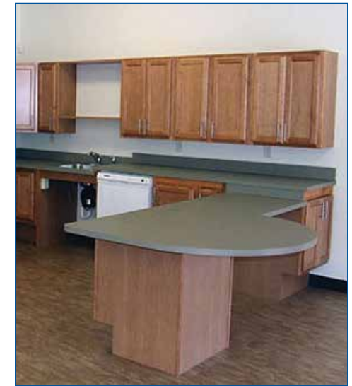
I The peninsula can be used as a table, kitchen work space, or a desk