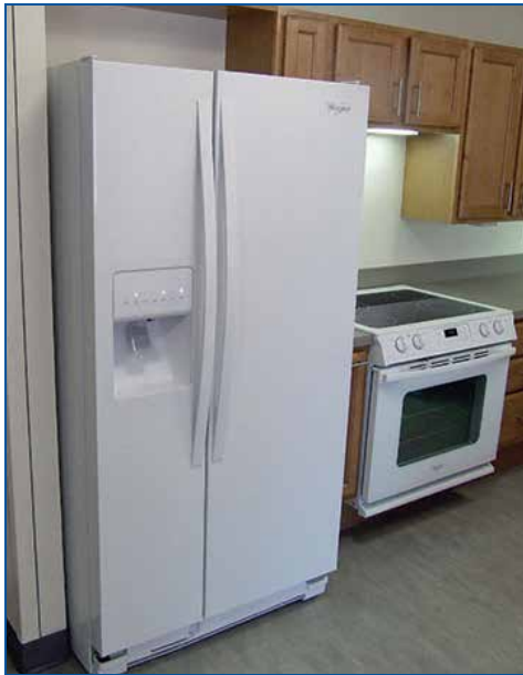
A Side-by-side refrigerator B Range with front controls