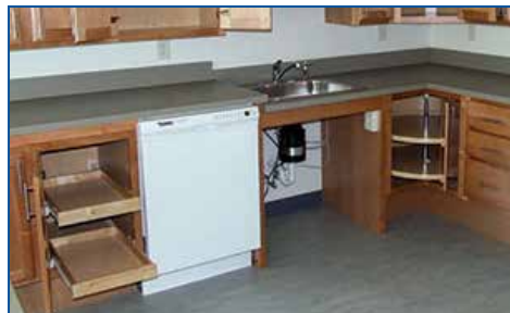
H Cabinets feature roll-out shelves